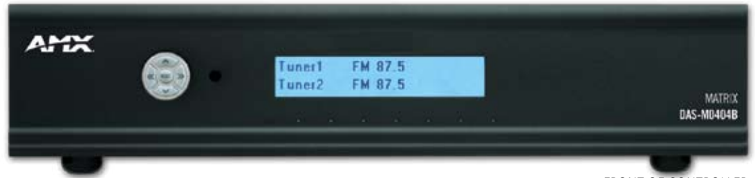
FRONT OF CONTROLLER

The Mi Series Audio Controller is a feature rich product designed with a focus on reliability, flexibility, performance, and ease of use. The system is tailored to a homeowner's current needs, and can grow with the home and family. The Mi Series modular design is engineered for future technologies so that adding zones, upgrading to LCD Touch Screen keypads, and adding a tuner module or network interface card can be easily accommodated.