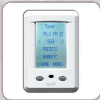
LCD TOUCH SCREEN CONTROL

AMX Distributed Audio brings you the next generation of multi-room audio. Supported by our exclusive Speaker Wire Technology (SWT), Mi Series offers significantly enhanced drive capability, enhanced audio performance, LCD Touch Screen control, and Network Interface Card, enabling you to control your entire system from any PC on your home network.