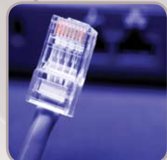
FULLY INTEGRATED ETHERNET CONTROL