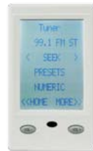
LCD SURFACE MOUNT TOUCH SCREEN (available in white only)