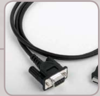
HOME AUTOMATION CONTROL