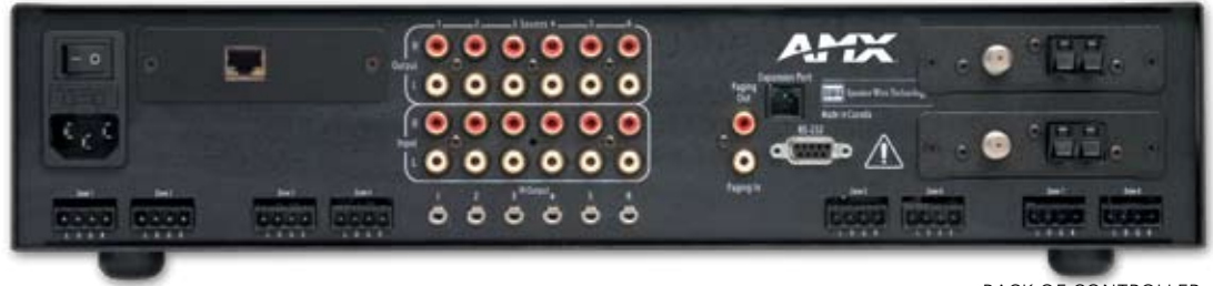
BACK OF CONTROLLER