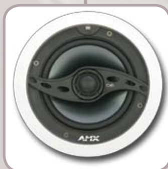
BUILT-IN SWT WITH IR SPEAKER CONTROL