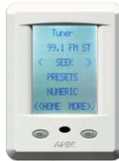
LCD FLUSH MOUNT TOUCH SCREEN